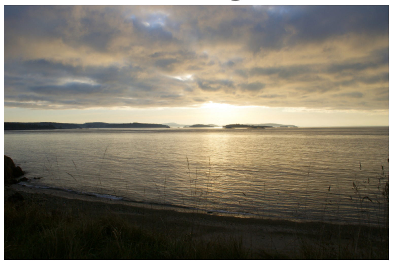
With freedom's holy light