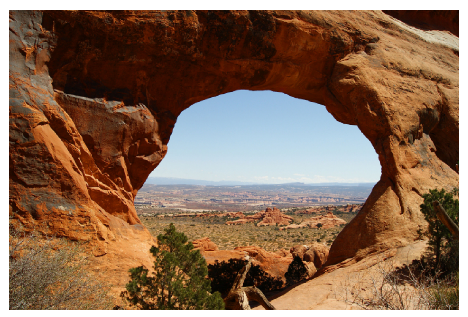
The sound prolong